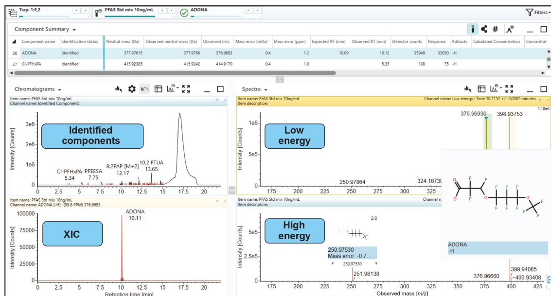
Figure 3. Screenshot of UNIFI sample review table featuring simultaneously acquired low and high energy spectral data visualizing structures of the intact ADONA (3H-perfluoro-3-[(3-methoxypropoxy)propanoic acid]) and fragment information.

Using the Full Scan with Fragmentation function allows cone voltage ramping to simultaneously acquire high and low energy spectra. The high energy data function, containing fragment ion information, was assigned automatically providing further confidence for compound identification with visual assignments to aid in speedy data appraisal (Figure 3).